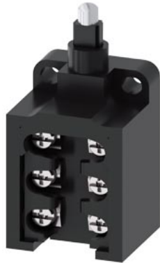
Position switch Plastic enclosure open type 30 mm 2 NO/1 NC slow-action contacts Metal plunger, IP10