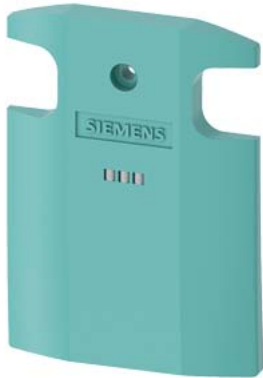
LED cover for position switch Metal 3SE51 2 LEDs, yellow/green, 110-230 V AC Color turquoise