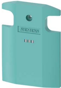
LED cover for position switch Metal 3SE51 2 LEDs, yellow/green, 24 V DC Color turquoise