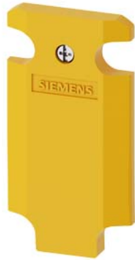
Cover yellow for position switch metal 3SE51, enclosure, according to EN 50041