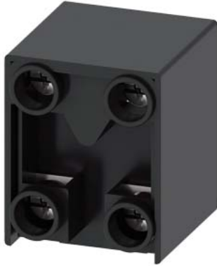
Contact block IP20 for position switch 3SE5250 open type design 1 NO/1 NC slow-action contact