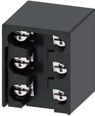
Switching element for position switch 3SE51/52 1 NO/2 NC slow-action contact