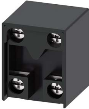
Contact block for position switch 3SE51/52 1 NO/1 NC quick action contact gold-plated contacts