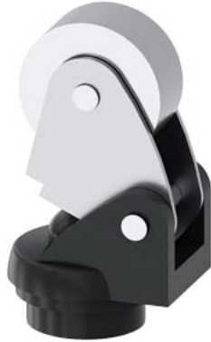
Actuator head for position switch 3SE51/52 Roller lever Metal lever and Stainless steel roller 22 mm