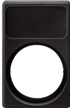
Label holder for labeling plate, Label size 9.5 x 18.5 mm,