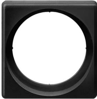
Single frame of square design