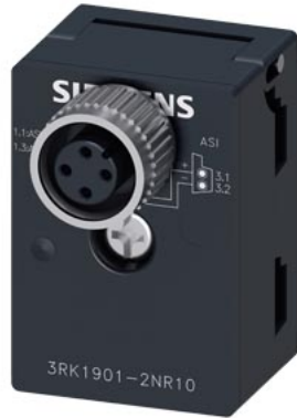
AS-Interface M12 branch U_ASI without Uaux, with M12 socket IP67/68/69K, max. 4 A